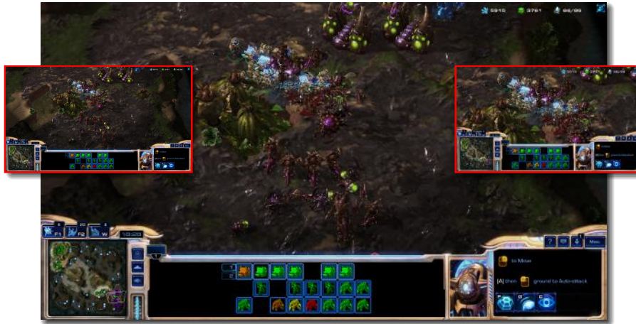
Fig. 1: A Protoss army (gold; green on mini-map) attacking a Zerg army (brown; purple). Left: uniform scaling, right: non-uniform scaling

games. A variant, adaptive interfaces, achieves similar aims by pre-formatting a web site for 6 different screen size configurations.